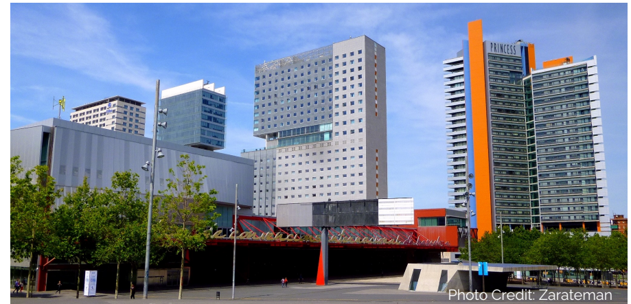
Centre de Convencions Internacional de Barcelona (CCIB)

https://chi2026.acm.org/sponsors-and-exhibitors/