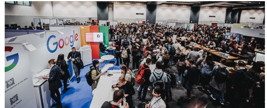
Exhibitor booth setup example from a previous year.

CHI features a Job Fair on a day of the main program. Recruiters renting booths are invited to take advantage of this key event to meet qualified job candidates. CHI will also help coordinate space for interviewing and events when possible. Confirmed recruiters are posted on the CHI website.